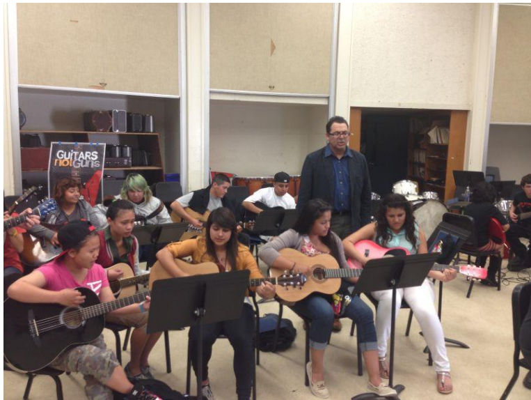
A Guitars Not Guns class in south Monterey County.

“To be honored by the Arts Council as a Champion of the Arts means a lot to me, but as I said at the award event, this honor should go to all of the musicians and volunteer instructors that I have worked with – they are the true champions,” he says.