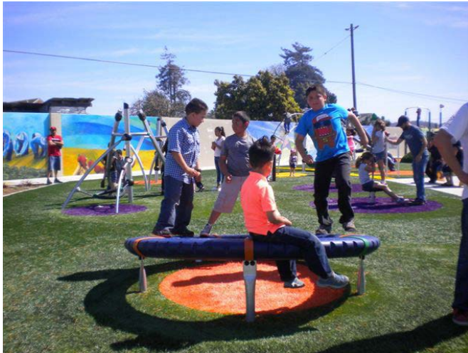
Children at play in the playground area during the park's opening day. More than a thousand people turned out to inaugurate the park last year.

Years in the making, the park was a community collaboration between the County,