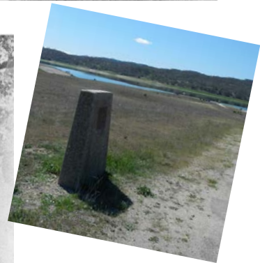
A marker near Lake San Antonio notes where the town once stood.