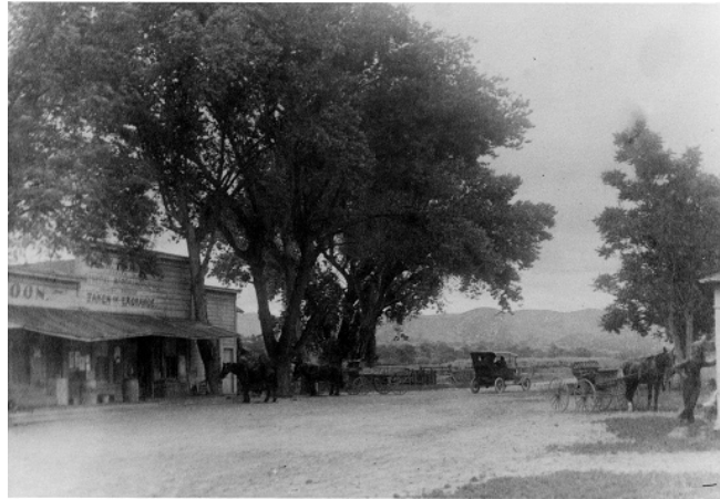
A look into the past at the town of Pleyto in south Monterey County. The town main street (right), residents picnic under the trees (below).

The post office closed in 1929 and the town receded into memory. By 1964, when the San Antonio Dam was completed, the few vestiges of the pioneer settlement that remained were covered by lake waters.