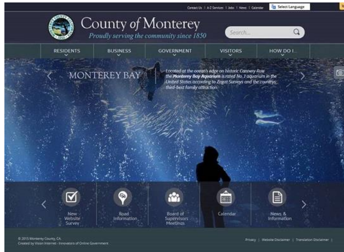
Screen capture of the new county webpage.

Design work on the website was done primarily by ITD staff with development assistance provided by a company that specializes in government websites. Also assisting in the effort was a multi-department employee working group which met periodically over a year’s time, discussing and reviewing top website needs.