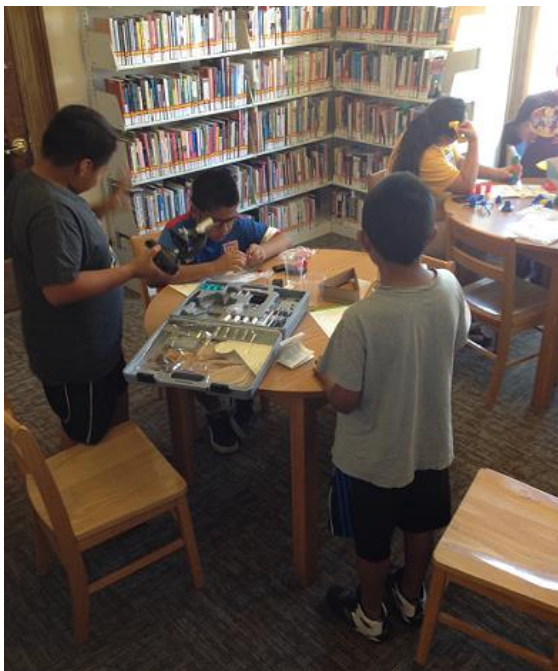
Kids explore contents of the science kits.

MCFL raised $2,300 for Summer Science Kits through the annual Monterey County Gives program. The Science Kits at each of the Homework Centers contain the following items: