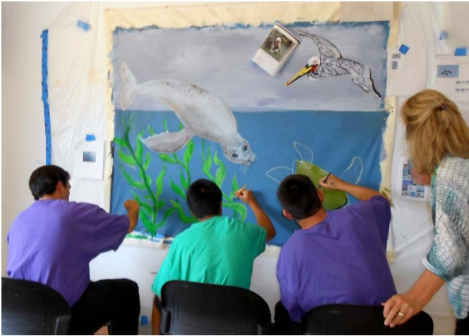
Students in the Arts as Healing Program work together on a mural project.

expression, discover hidden talents and most importantly, to experience success and feelings of worth in pro-social activities.