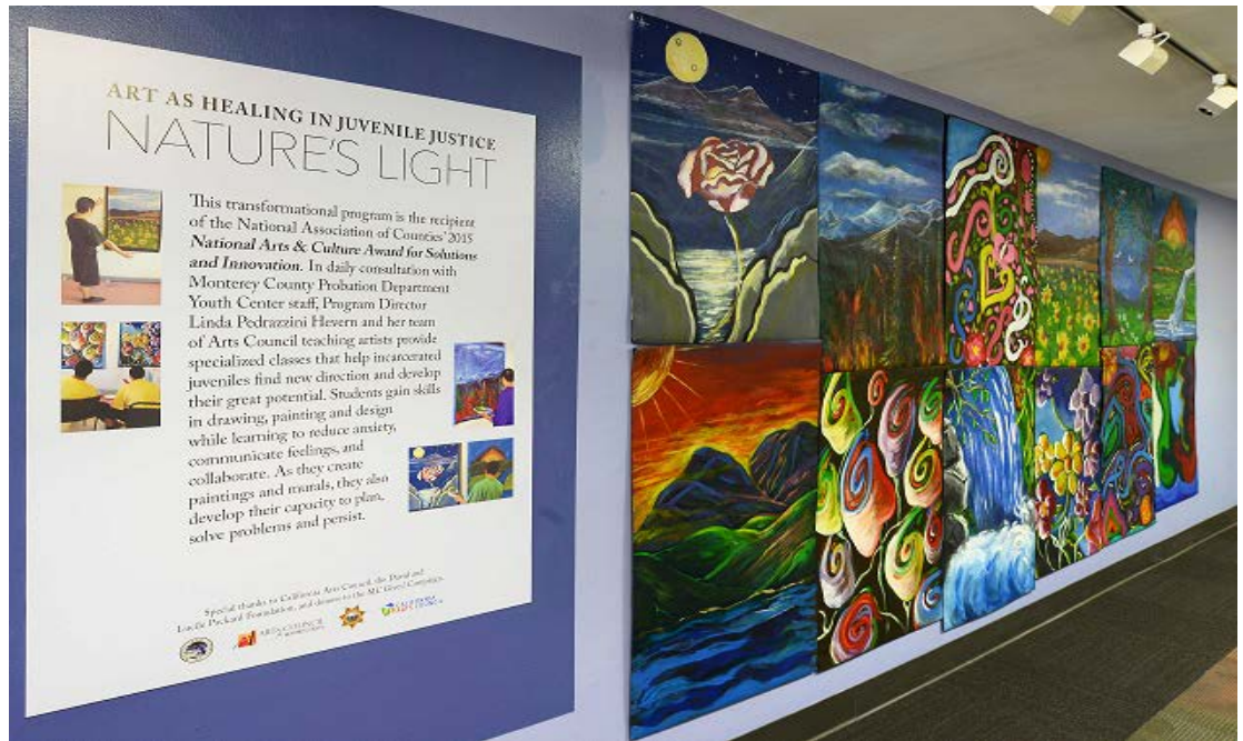
Artwork done by young men in the Monterey County Youth Center is seen at the Monterey Airport.