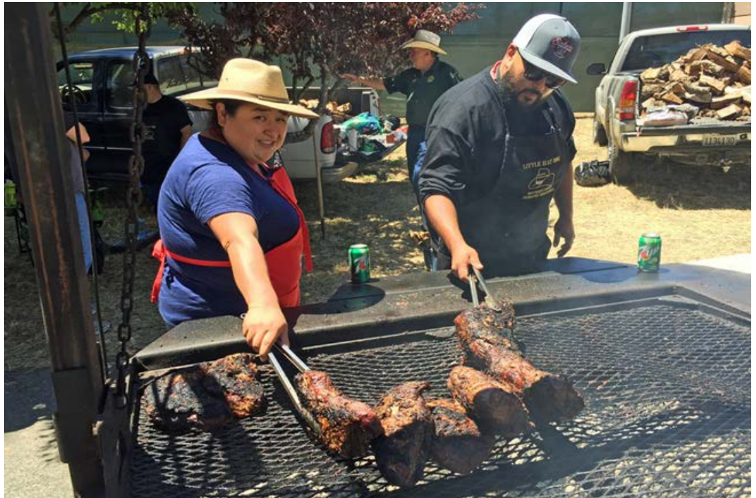
Where there's smoke there's barbeque at the Probation Department's Little Hat Barbeque event.