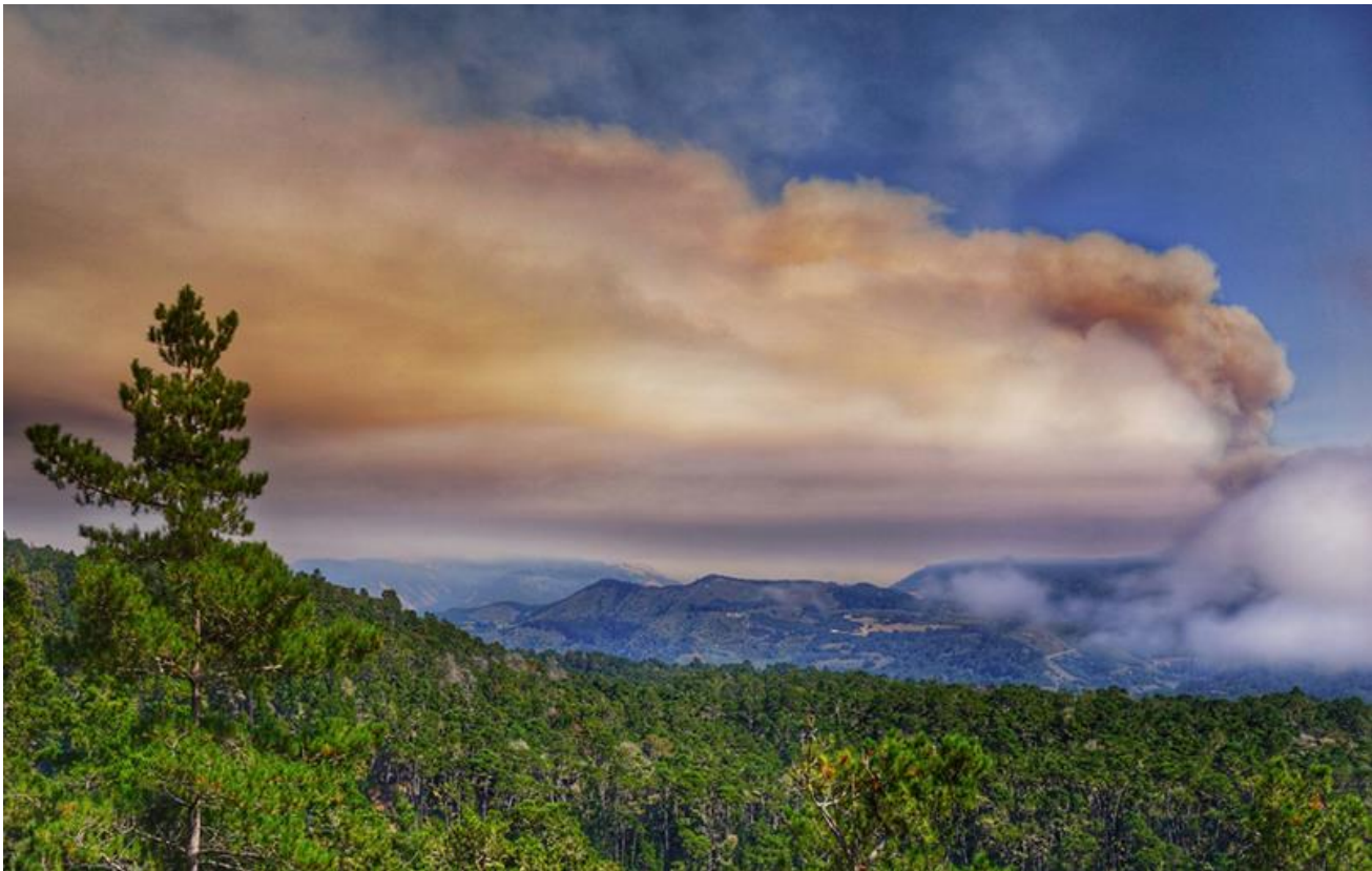
"FireNight5: Santa Lucia Preserve"