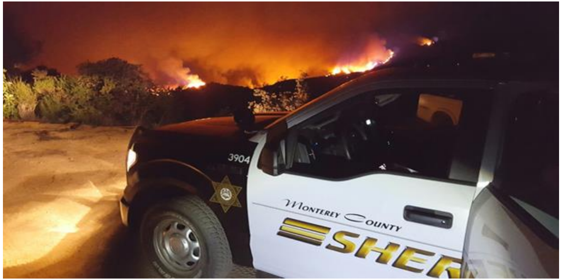
A sheriff's patrol comes upon flames as residents in the Palo Colorado area are evacuated.