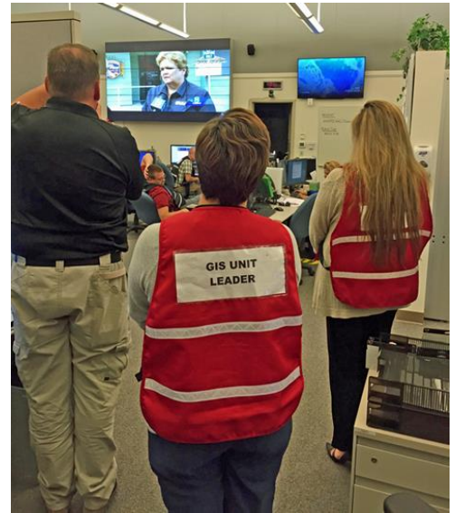
County staffers listen to comments from federal emergency representatives about the Soberanes Fire.

State leaders will be visiting the EOC Friday, to find out more about the work that has been done protecting the county during this blaze and the next steps towards recovery.