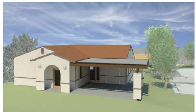
Architectural drawing of the new San Lucas library.