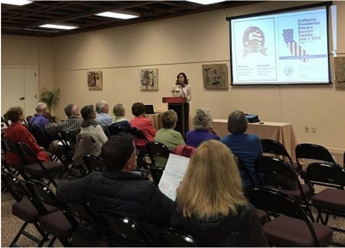
Elections staff held a voting information program at the Sunset Center earlier this month, just prior to a performance by the Capitol Steps political comedy group performance.

You hear a lot of talk about ‘getting out the vote’ during the election season, but getting voters ready to vote and helping them navigate and understand the process to make their choices is just as important.