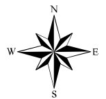
Figure # CA3