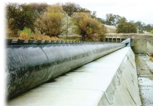
An example of a diversion facility

Your Salinas Valley Water Project Assessment ballot is enclosed.