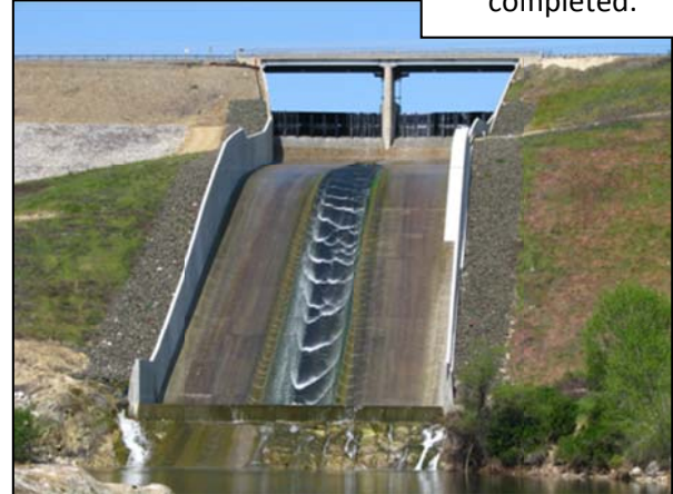
Nacimiento Reservoir Spillway Modification completed.