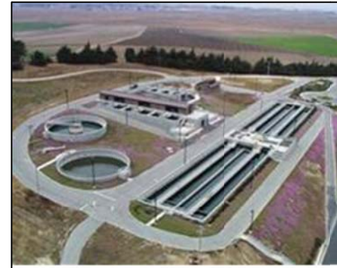
Salinas Valley Reclamation Project tertiary treatment plant