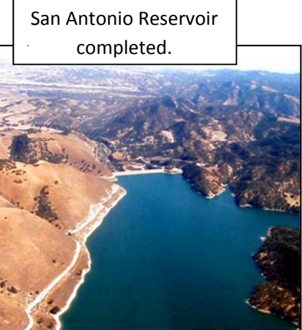
San Antonio Reservoir completed.

Complete construction and begin diverting water under Water Right Permit #11043.