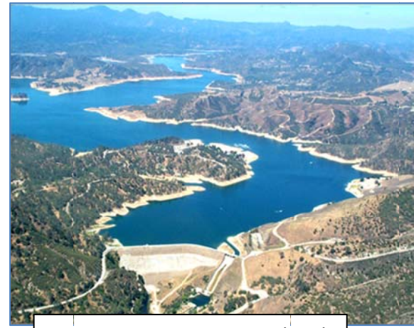
Nacimiento Reservoir completed.