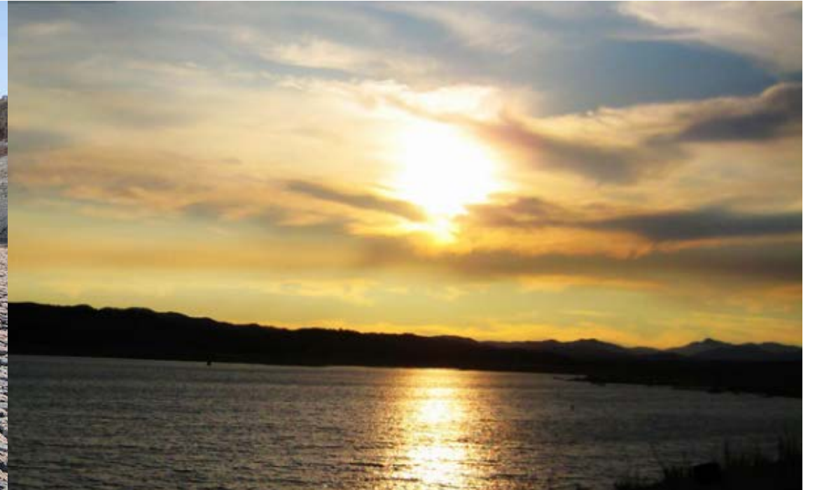
Lake San Antonio - 2017

South County Environmental Compliance Workshop April 12, 2017 – King City, CA