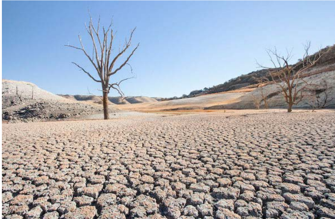
Lake San Antonio - 2016